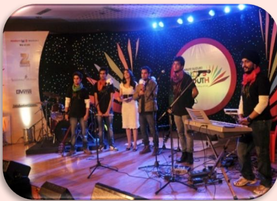
Participants from different regions performing in the talent round